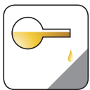
Mineral Oil Resistant

*Plus one auxiliary pair with 0.6mm conductors.